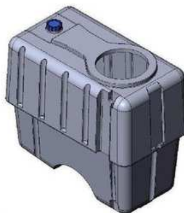
AGRO 600, 800, 1 000